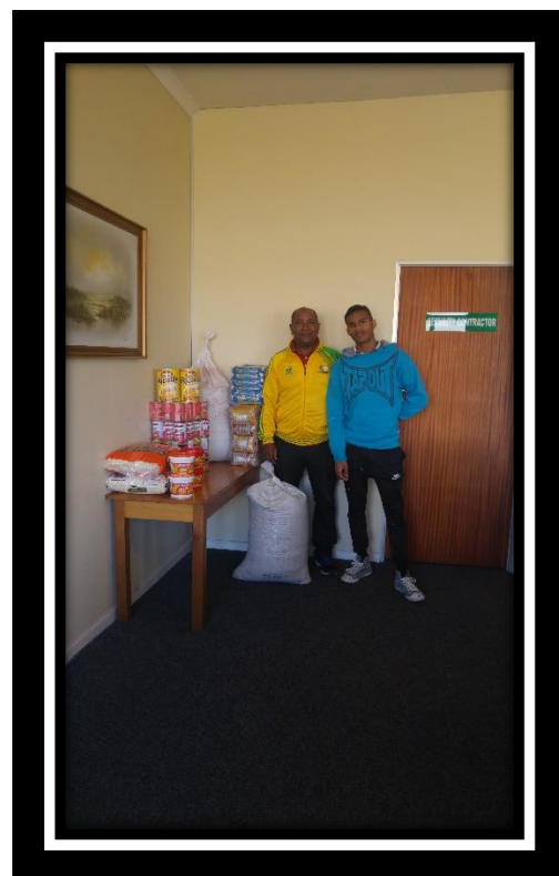
CHURCH OF THE NAZARENE BONTEHEUWEL