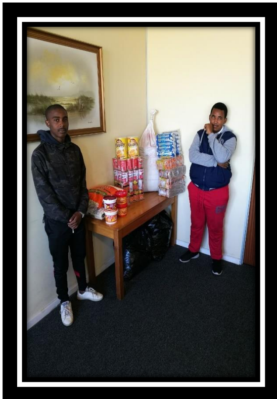
LANGA BAPTIST CHURCH

The ECID thank Giant Hyper, Pioneer Foods and Capepots for their continued, overwhelming support of those less fortunate