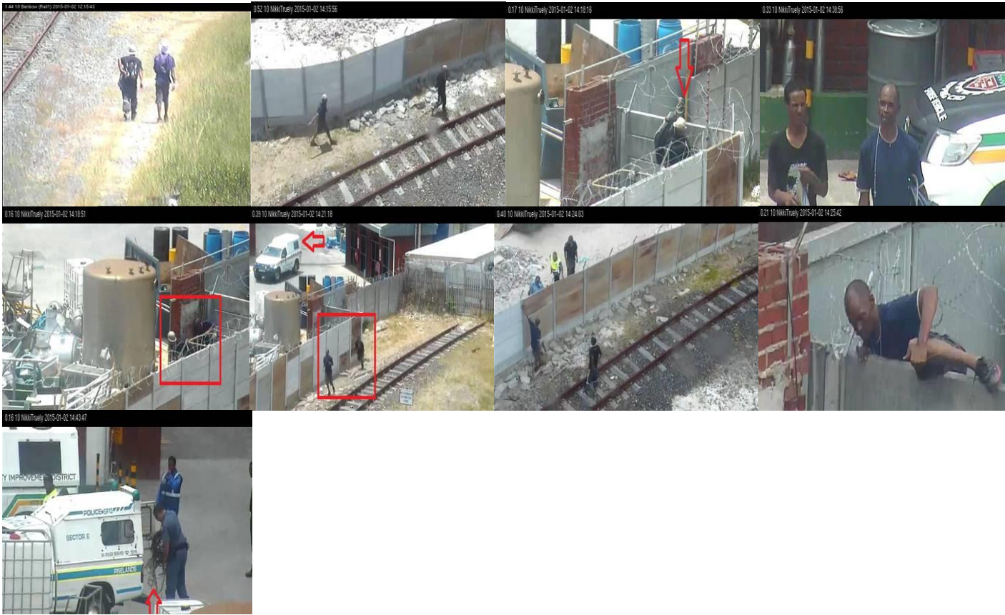
Benbow and Fisher 12:15:43 Arrest